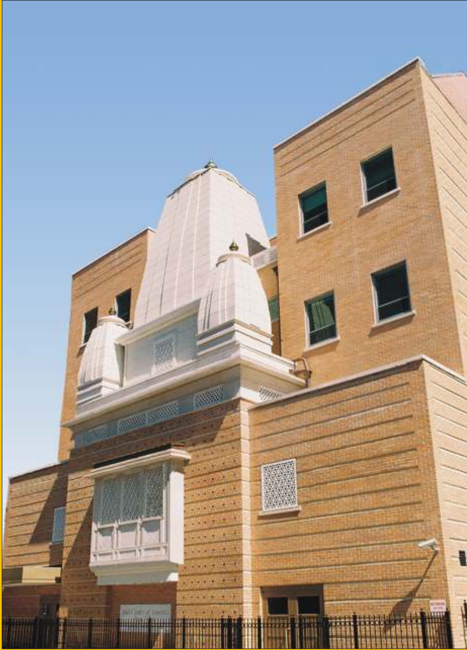
Jain Center of America New York